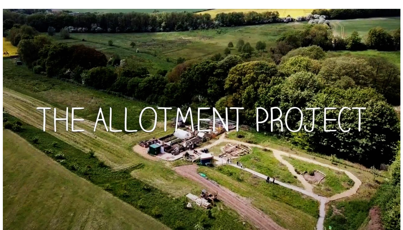
Example 1: The Allotment Project: A Short Documentary. Please <u>click here</u> to view online.

In this short guide, Louis will introduce some of the things to think about when making a film about a school allotment!