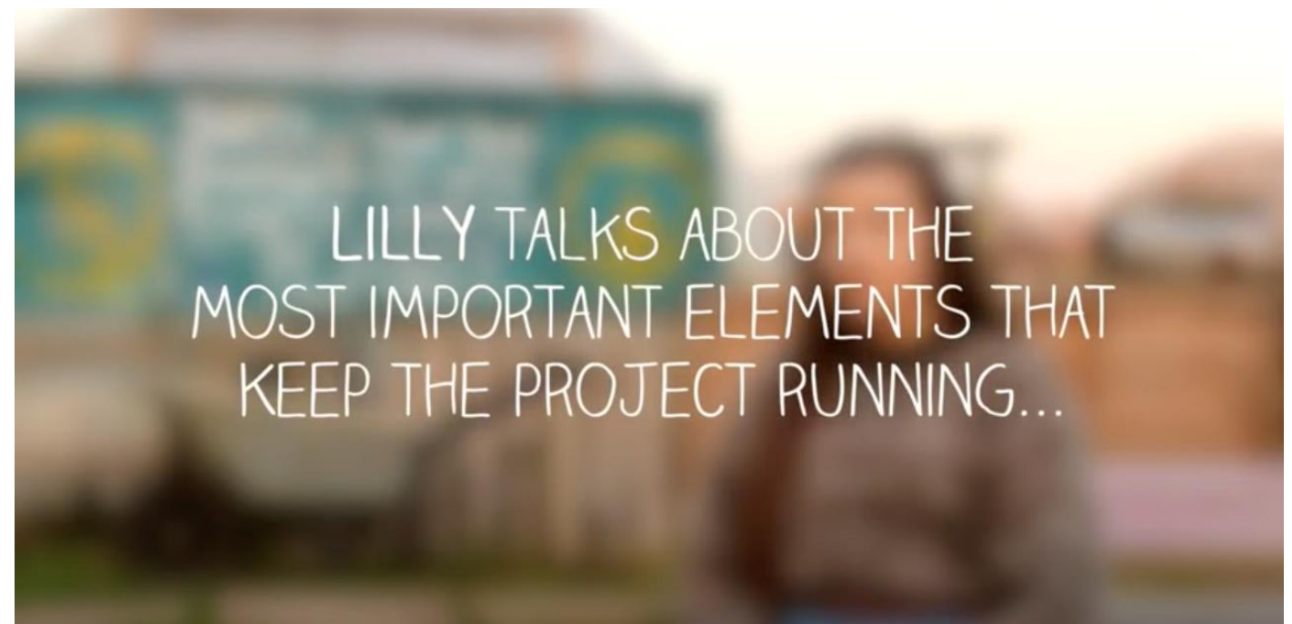
Example 5: Thoughts From the School Allotment series: a good example of a small film project. Please <u>click here</u> to view an example of this series created by Louis Johnson.