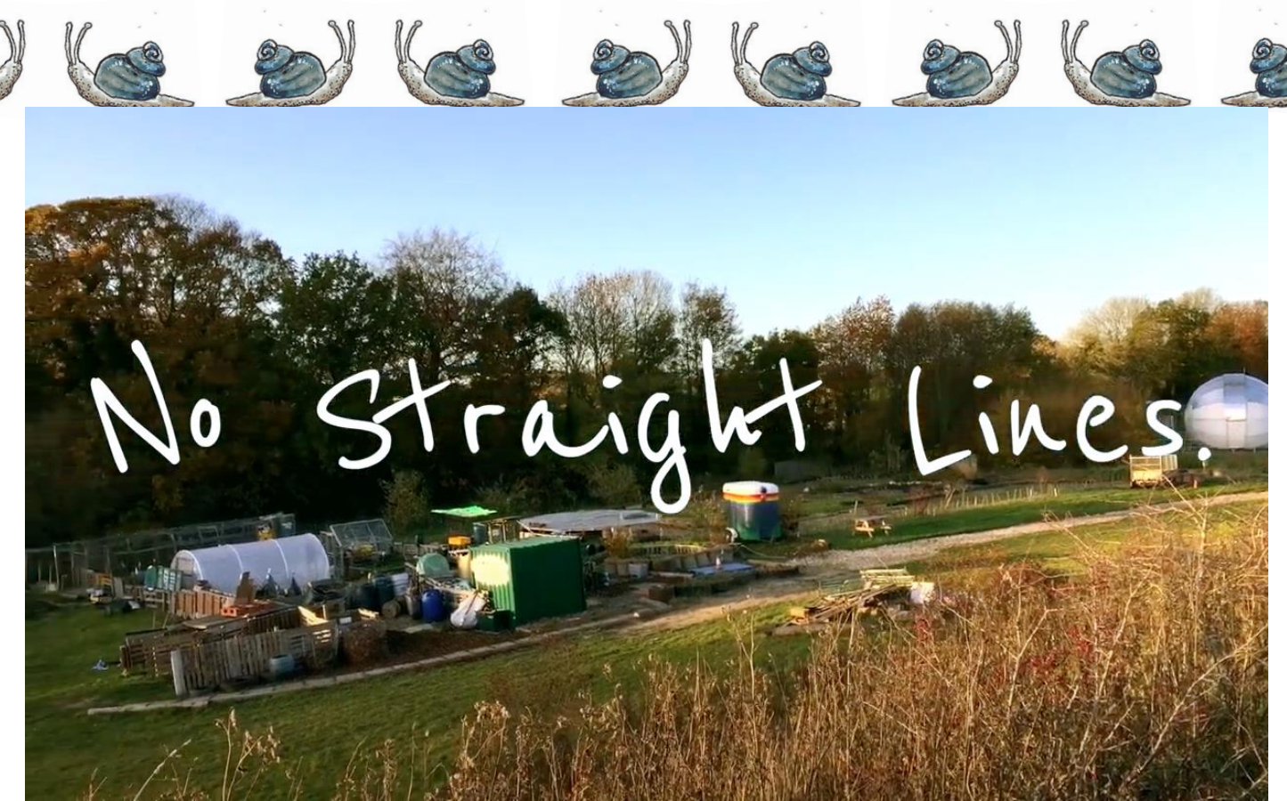
Example 4: No Straight Lines: a good example of big film project. Please click here to view this film's prologue: Why? online (by Louis Johnson).