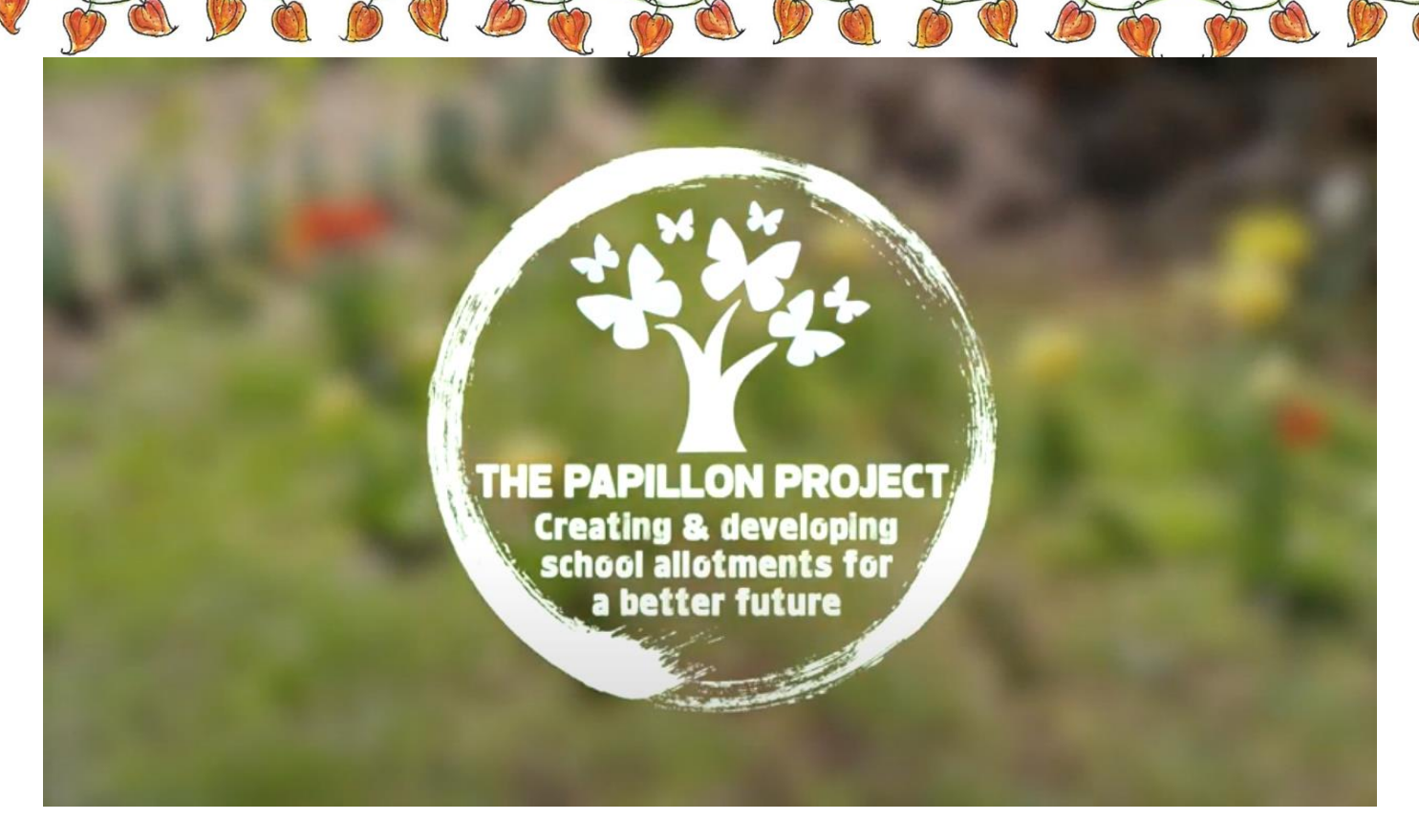
Example 3: Litcham School's allotment virtual tour. Please click here to view this online (by Louis Johnson).